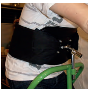
Belt and chest plate

Examples of accessories – look in our company brochure and on our website for latest info about colors, parts and accessories, that are used across PETRA, CAVALIER, FF and CROSS RUNNER.