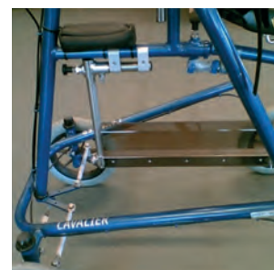
Leg separating plate