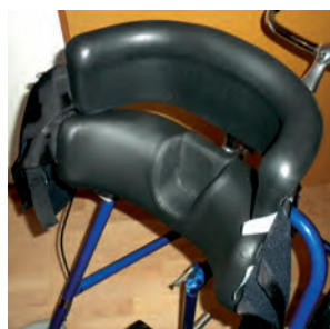
2 PUR supports